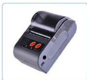
Bluetooth® Printer (Si-AQ Bluetooth® Printer)