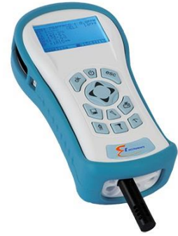
Model : SI-AQ PRO