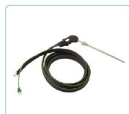
Sampling Probe (Si-AQ Probe with Hose)